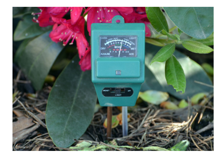
A soil moisture sensor in soil

Draw a diagram to show a smart watering system. Make sure to include the appropriate components and how they are connected.